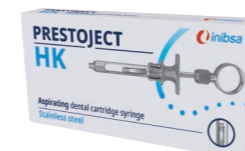
PRESTOJECT® HK 5376