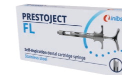
PRESTOJECT® FL 5375