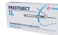
PRESTOJECT® IL 5373