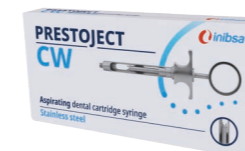
PRESTOJECT® CW 5374