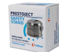
PRESTOJECT® Safety Stand 5372